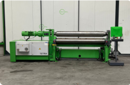
Plate rolling machines - HAEUSLER - TETRA 105