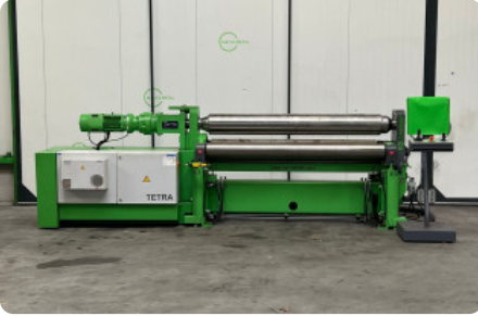
Plate rolling machines - HAEUSLER - TETRA 105